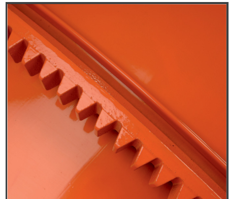
Gear rim and drive pinion made of abrasion-resistant grey cast iron as well as powder coating for a long life.