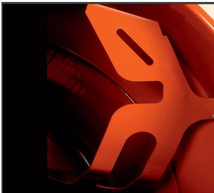
Specially shaped mixing rakes for good mixing results.