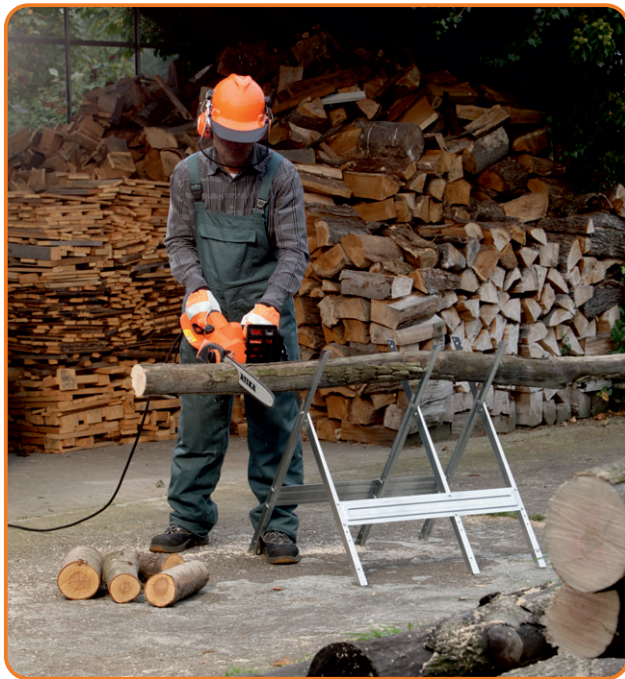
foldable after use