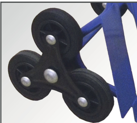
Rotatable, puncture-proof solid rubber star wheels with PP plastic rims and wheel guards.