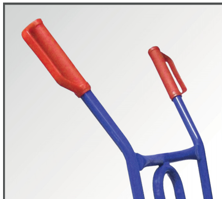
Non-slip handles with safety bar.