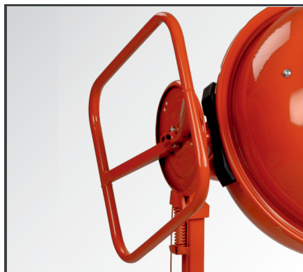
Ergonomic and smooth-running hand wheel with disc brake & foot control for stepless adjustable mixing drum.