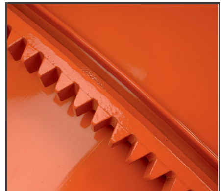
High life expectancy thanks to powder coating and abrasion-resistant grey cast iron for the gear rim and drive pinion.