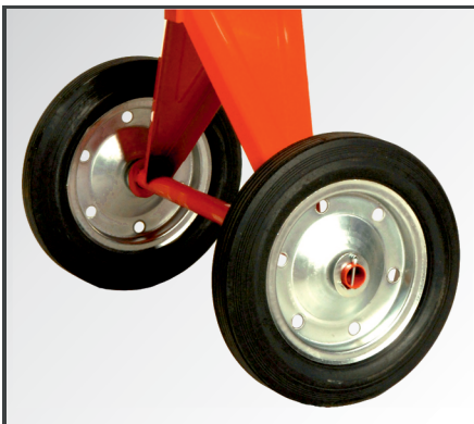
Large wheels (Ø 400 mm), with metal rims and puncture-proof solid rubber tyres, for easy transport.