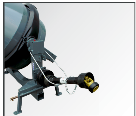
PTO connection and practical PTO holder. PTO shaft (510 mm long) available as an accessory, order-no.: LZ030