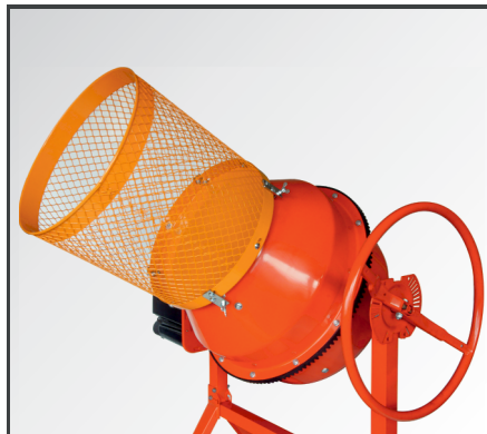
Simply mount on the flanged drum opening of the concrete mixer.