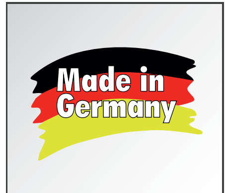
Quality - Made in Germany.