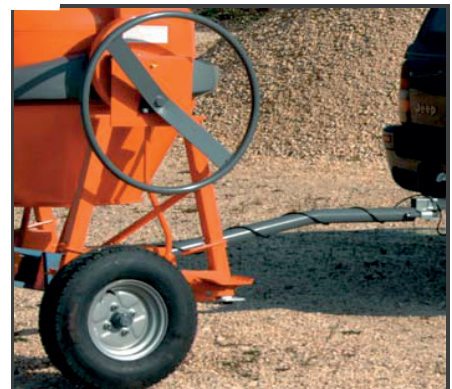
Large handwheel with slewing gear and foot pedal as well as chassis with 13" steel rims and road tyres (135).