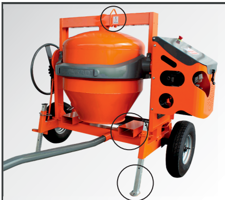
Lifting eye and forklift adapter for easy moving. Galvanised, telescopic legs for a safety stand.