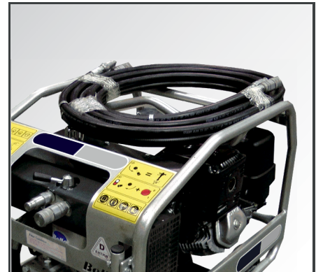
7 metre Siamese hose included.