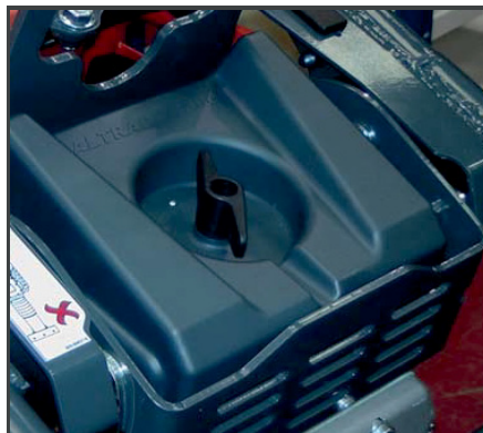
The triple-filtration air cleaner system guarantees high reliability.