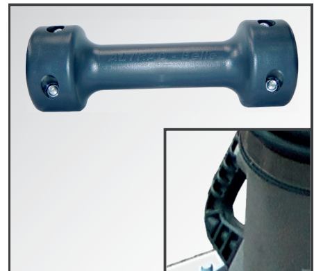
Comfortable transport roller and transport handle for easy transport included.