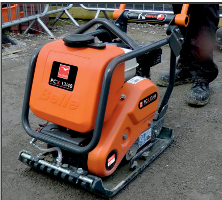
*Optional with water kit (water tank & water spray system) or available as accessories: Order-no. BEOPP/71S/DIO