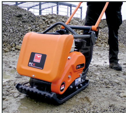
High-frequency vibration unit with 13 kN at 101 Hz, maintenance-free vibration bearings and a reinforced centrifugal clutch for a long service life.