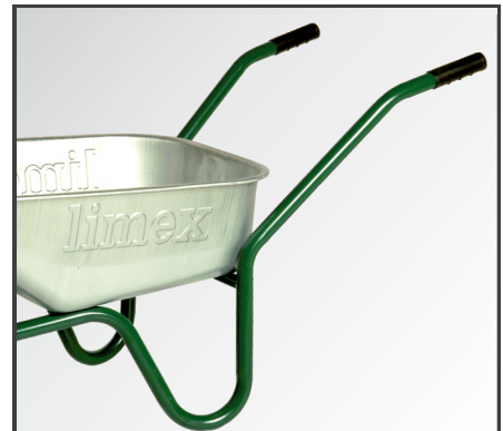
Sturdy, 1-part & powder-coated steel tube frame with non-slip plastic handles.