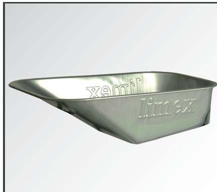
Galvanised tray with straight front made of steel sheet.